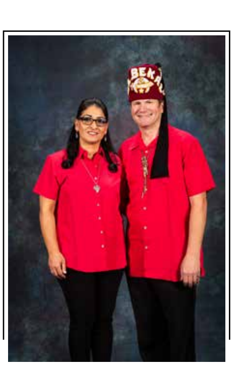
DC - 3 Shrine Casual

Theme events Wear theme outfits (optional)