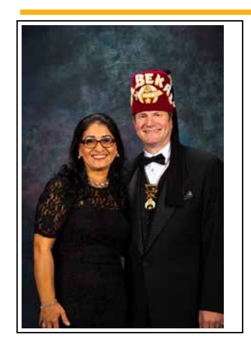
DC - 1 Formal Men - Tux Women - Dresses