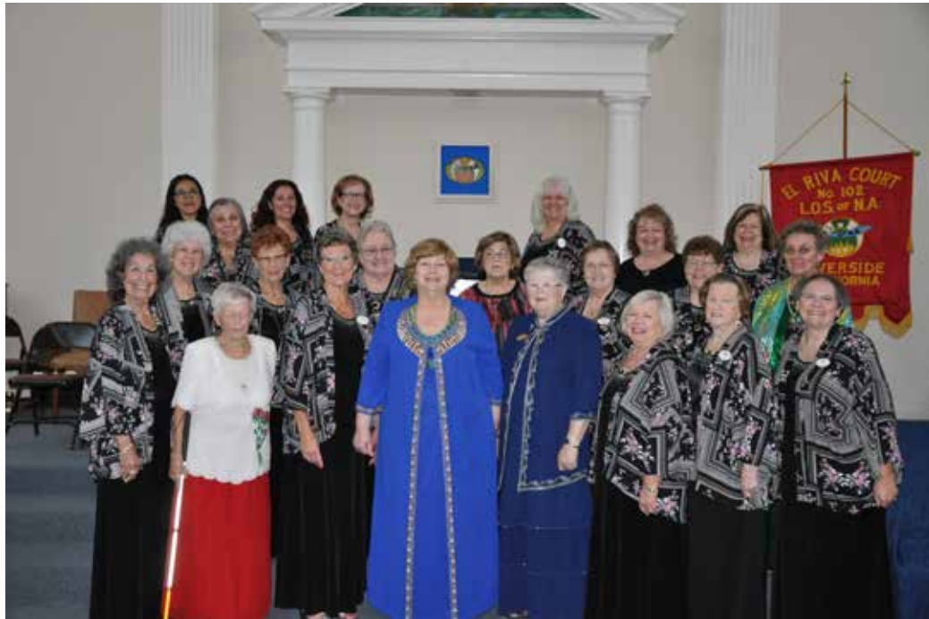
High Priestess Lynnette Channing