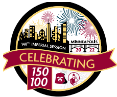
Imperial Sir Bill Bailey